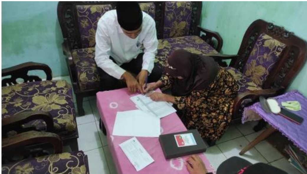
Picture 9. KPPS Visit to DPT Houses to Exercise Voting Rights