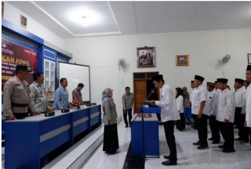
Picture 2. Inauguration and Oath-taking of KKPS in Temon Kulon Village

The implementation of inclusive regional elections at the village level begins with: first is the inauguration of the KPPS, there is an oath-taking session to hold honest and fair elections. Fair here can be interpreted as an inclusive guideline for violations that are evenly distributed to all.