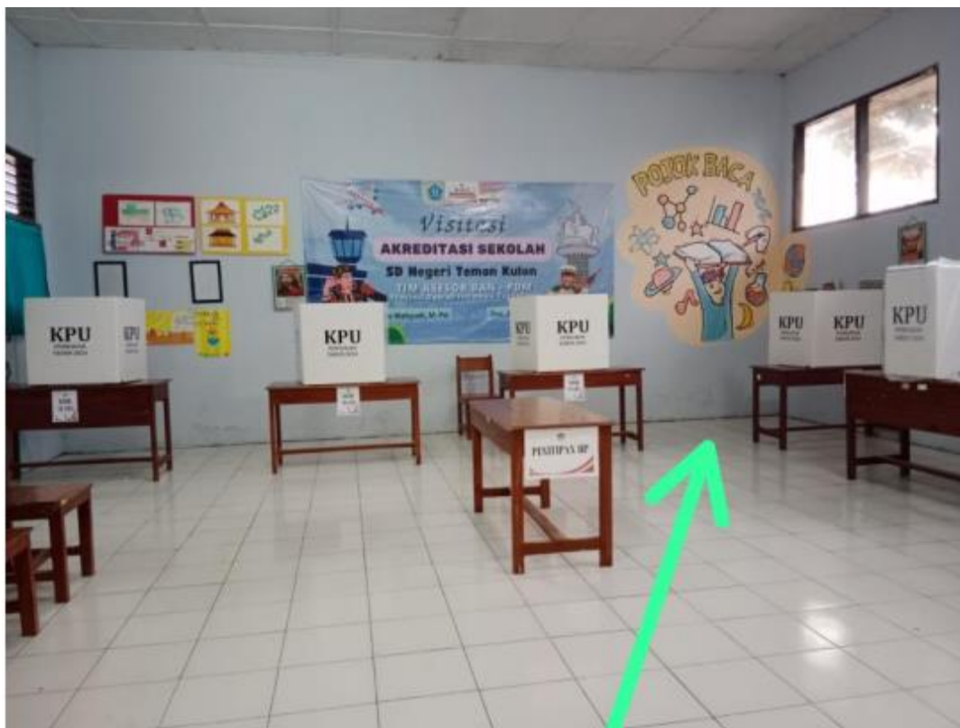
Picture 6. Access to Voting Booth 4 for the Disabled at TPS 03