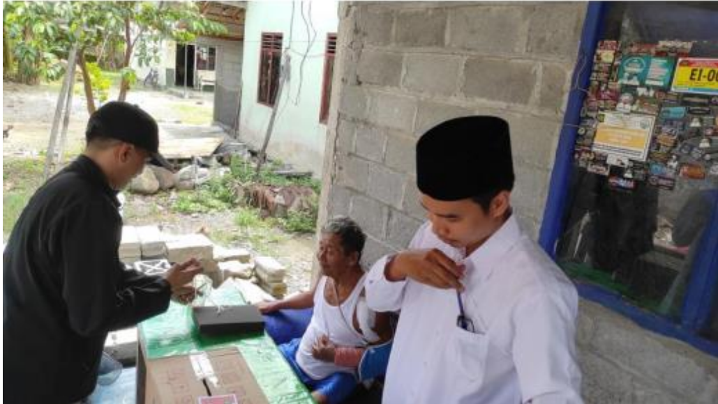
Picture 10. KPPS Visit to DPT Houses to Exercise Voting Rights

Based on the DPT in Kulon Progo Regency, there were 345,540 voters, of whom 274,048 used their voting rights (255,142 valid votes equivalent to 93.1% and 18,906 invalid votes equivalent to 6.9%). Based on the participation rate, it was equivalent to 79.26%, a slight increase compared to the 2017 Pilkada which was equivalent to 79.16%. Voters consisted of 273,140 DPT voters, 698 transferred voters, and 210 additional voters. Then, if it was reduced based on data from the Kulon Progo Regency KPU, the participation rate of disabled voters in the 2024 Pilkada was 24.78%. This means that out of 5,166 registered as DPT, only 1,280 used their voting rights, the low participation was due to family factors that did not allow the person concerned to come to the TPS to use their voting rights. This actually decreased compared to the 2017 Pilkada which reached 40%. Mostly occurs in voters with mental disabilities. 8 Families feel embarrassed when inviting DPT disabled people to public spaces, this is the main reason for the declining participation. This is the importance of a comprehensive approach for disabled voters.