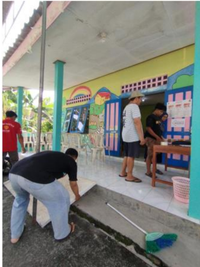
Picture 5. Installation of Boards for Wheelchair Access at TPS 02