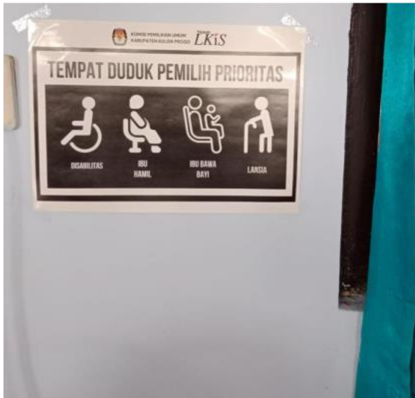
Picture 7. Instructions for Priority Voter Rooms/Seats at TPS 03