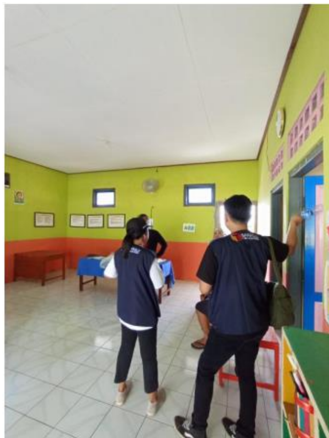
Picture 4. KPPS, PPS, and Panwaslu Ensure Inclusive TPS 02 Makers

Fourth, preparation of TPS by providing access for the disabled, at this stage the KPPS will be with the PPS (Voting Committee) at the Village level and Panwaslu (Election Supervisory Committee) at each TPS.