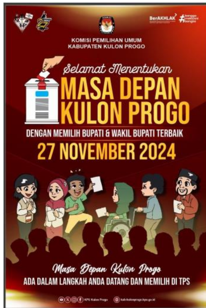
Picture 1. Inclusive Election Socialization

As previous research recommends TPS that are accessible to voters with disabilities with various types of disabilities including the TPS environment, the shape of the voting booth, the position of the ballot box that is not too high, and so on. The Kolon Progo KPU also conducted socialization through flyers/pamphlets which in the picture contained illustrations of voters from various conditions, including illustrations of voters using wheelchairs, as in the picture below..