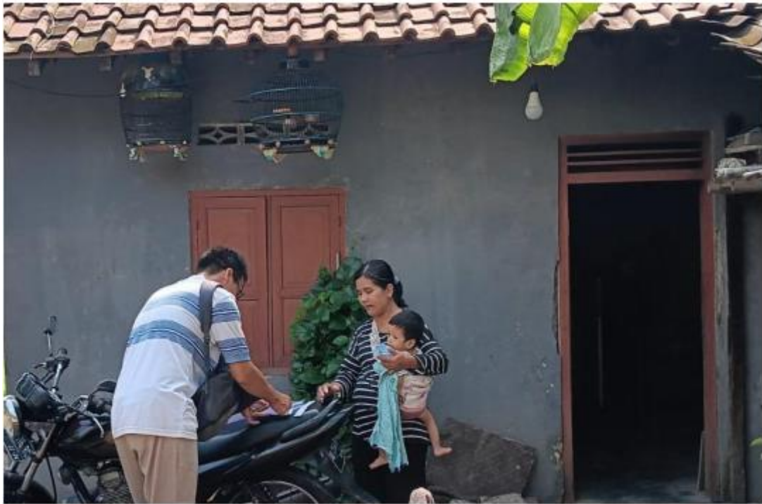
Picture 3. Submission of Voting Notification Letter to DPT

Fourth, preparation of TPS by providing access for the disabled, at this stage the KPPS will be with the PPS (Voting Committee) at the Village level and Panwaslu (Election Supervisory Committee) at each TPS.